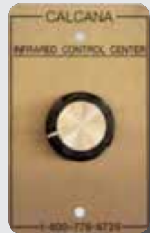
Modulating remote control panel (optional) (patent pending)